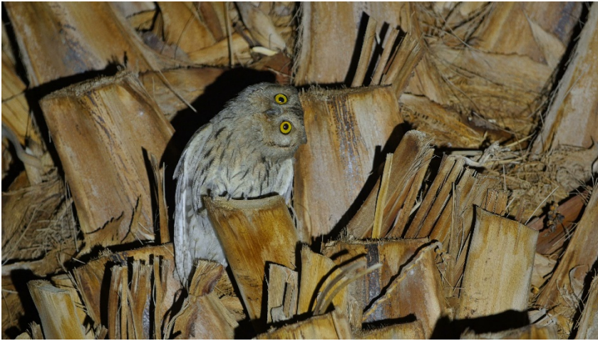
Pallid scops owl ( Otus brucei ) adult on a date tree at night, 2016.