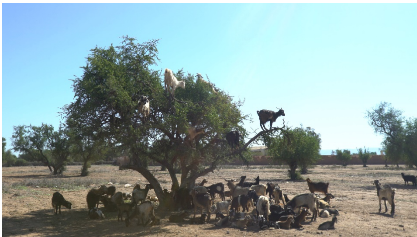
Goats climbing and eating the famous Argan oil tree in the Atlas mountains of Morocco, 2018.