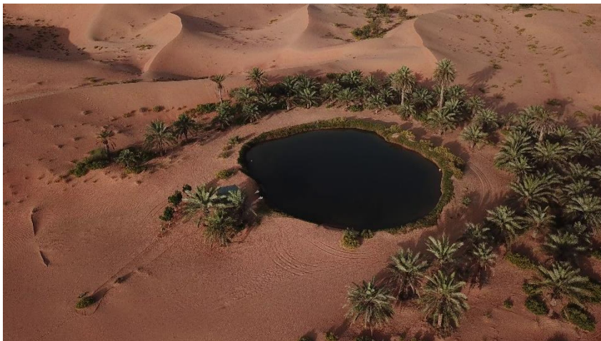
Al Ain Oasis, Abu Dhabi.

Contact - https://www.vromero.com/ | contact@vromero.com | +971557288857