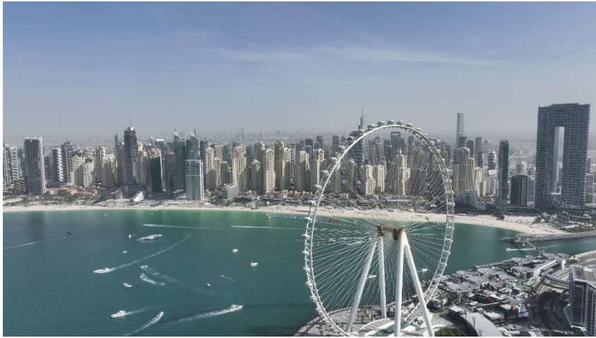
Skyline with Ain Dubai Ferris Wheel, Dubai.