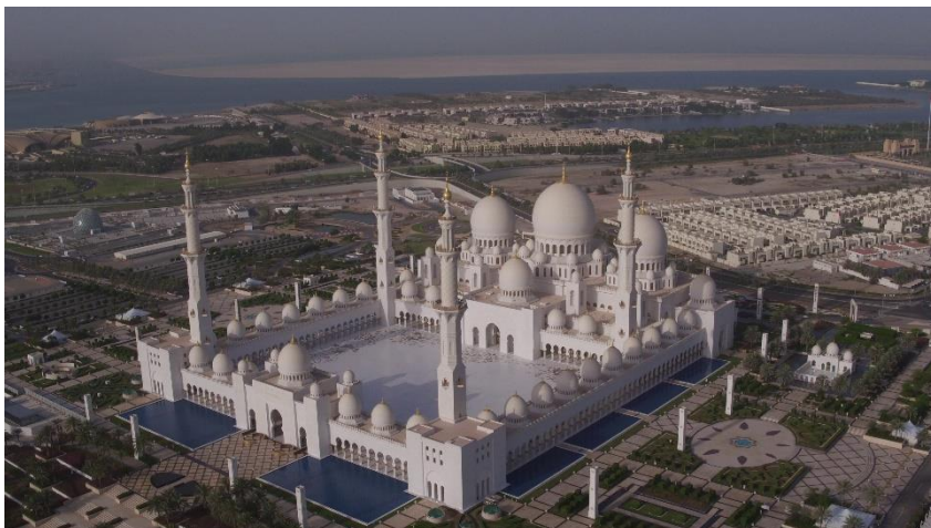
Sheikh Zayed Grand Mosque, Abu Dhabi.