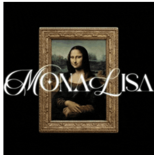
Bridgeman Images and ElmonX have collaborated to create Da Vinci's Mona Lisa NFT. © ElmonX / Bridgeman Images