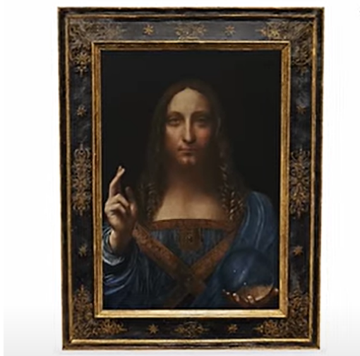
Bridgeman Images and ElmonX have collaborated to create Leonardo da Vinci's Salvator Mundi NFT.

By combining Bridgeman Images' curated arts content with ElmonX's cutting-edge NFT technology, this partnership aims to deliver exceptional visual experiences to art enthusiasts and collectors. The exclusive nature of this collaboration ensures that the NFTs produced will be of the highest quality and will offer a one-of-a-kind opportunity to own and appreciate rare digital artworks.